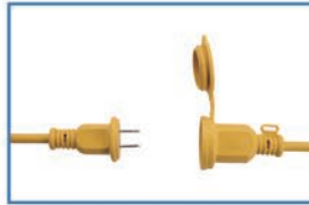
16/2 SJTW Cord (100 ft)