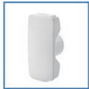
LED Bulbs (10 Bulbs Included)